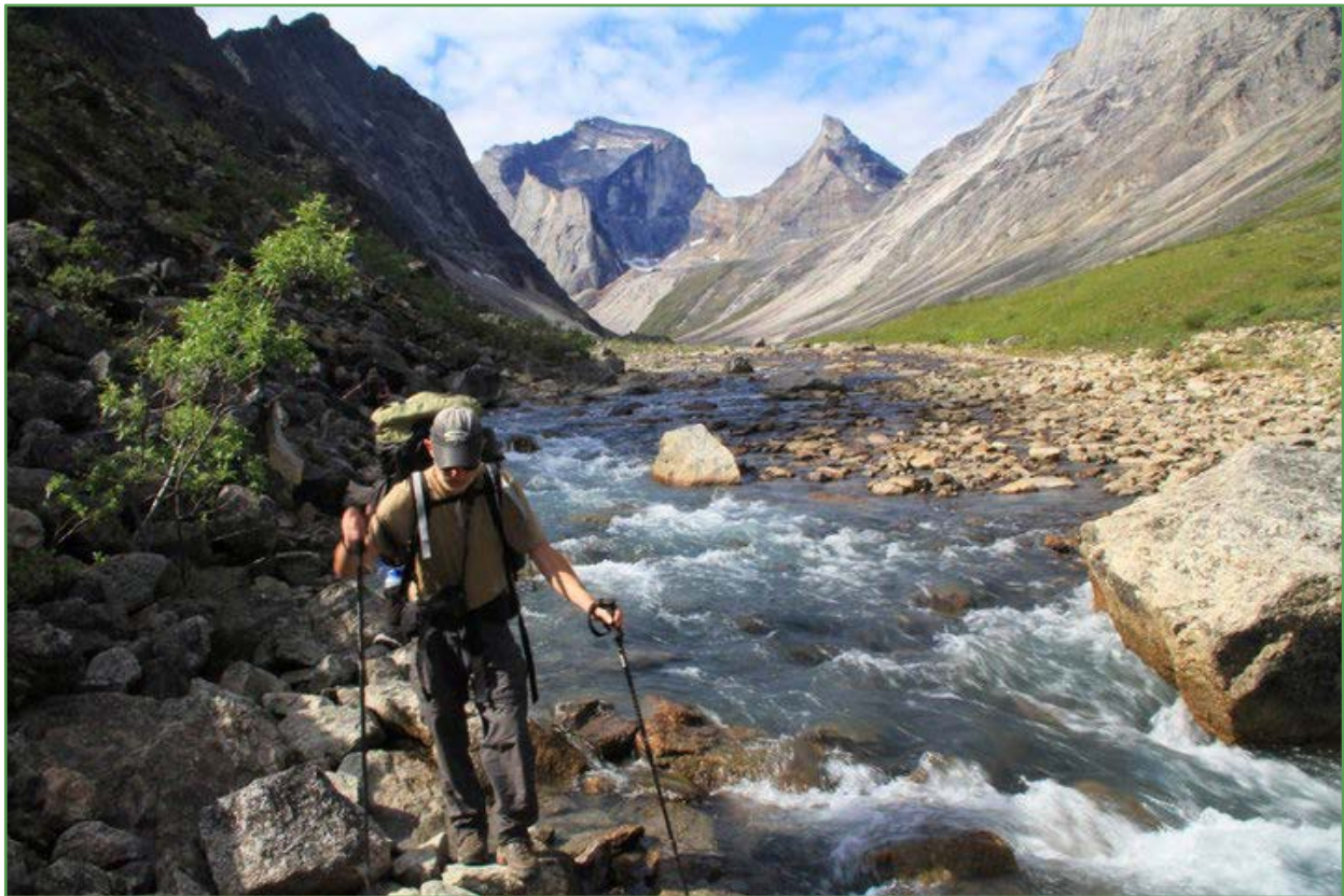
Carefully working our way along the Alatna Riverbanks

GRATUITIES: Tips to guides are left entirely to your discretion. While any amount is greatly appreciated, tips often range from 5-10% of the trip cost per person and are split among the guides.