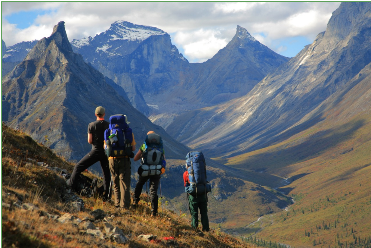
Taking in the view with the Alatna River below

This is an expedition-style backpacking trip and you will be expected to carry a backpack weighing roughly one third of your body weight over steep, mountainous, and inconsistent terrain for many days. You may hike up to 10-miles in a day with up to 3000' of elevation gain/ loss. You will likely encounter longer stretches of thick vegetation and may also experience Alaska's diverse selection of insect species. You will be camping in a very remote wilderness, sleeping in tents, relieving yourself in places with a stunning view, and sometimes enjoying all of that in the rain. You will be expected to load and unload your own gear, carry a portion of the group gear, and manage your own physical comfort and well-being. Previous backpacking experience may be required and is certainly recommended for these trips. Pre-trip physical conditioning should begin no later than 3 months prior to departure and must include hiking or walking with at least 45 lbs. in your backpack.