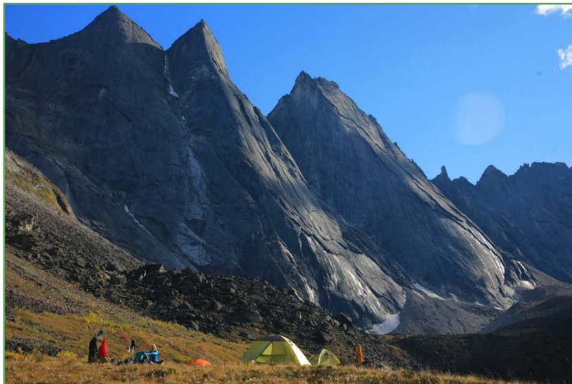
Camp set up beneath the Arrigetch Peaks

Both TRAVEL GUARD & RIPCORDER are good options. We're excited to share Alaska with you, in the most authentic way we believe possible! Thanks so much for understanding, and for choosing Alaska Alpine Adventures. We'll see you in Alaska soon!