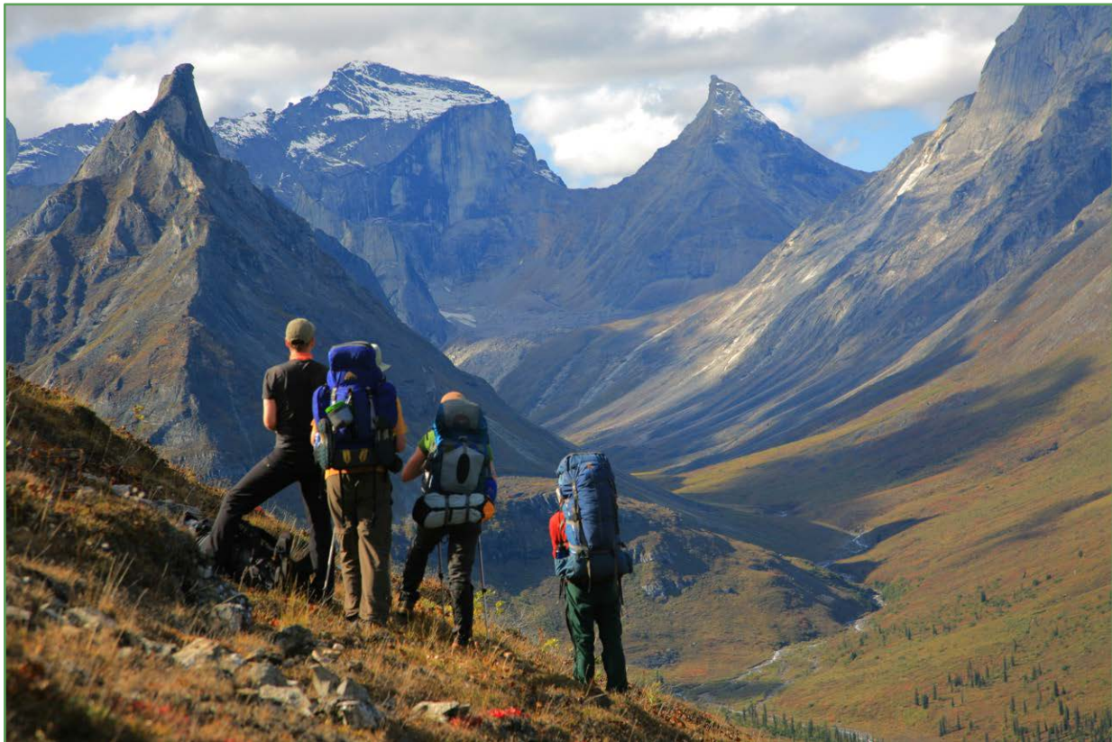
Taking in the view with the Alatna River below

This is an expedition-style backpacking trips and you will be expected carry a backpack weighing roughly one third of your body weight over steep, mountainous, and inconsistent terrain for many days. You may hike up to 10-miles in a day with up to 3000' of elevation gain/ loss. You will likely encounter longer stretches of thick vegetation and may also experience Alaska's diverse selection of insect species. You will be camping in a very remote wilderness, sleeping in tents, relieving yourself in places with a stunning view, and sometimes enjoying all of that in the rain. You will be expected to load and unload your own gear, carry a portion of the group gear, and manage your own physical comfort and well-being. Previous backpacking experience may be required and is certainly recommended for these trips. Pre-trip physical conditioning should begin no later than 3 months prior to departure and must include hiking or walking with at least 45 lbs. in your backpack.