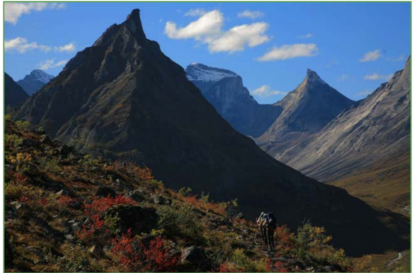
Fall colors and blue skies in the Brooks Range