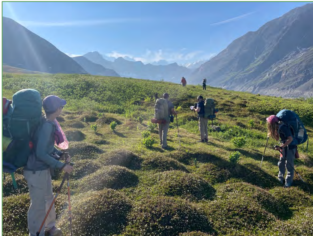
Dreamy Alaska backpacking under blue skies

Alaska has some of the most dynamic and dramatic weather on the planet. During the summer months in Alaska, average daytime temperatures range from 60° to 80°F. Nighttime and morning temperatures are cooler, but rarely dip below 40°F. Fall arrives early at these latitudes and you'll experience cooler temperatures and fewer hours of daylight in late August and early September. Throughout the summer season, you may experience rain, sun, wind, clouds, and fog on your adventure. We live by the adage "prepare for the worst, hope for the best, and you'll likely end up with some of both".