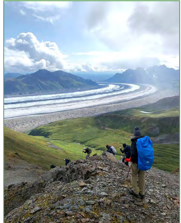
Hiking on talus down toward the Ruth Glacier