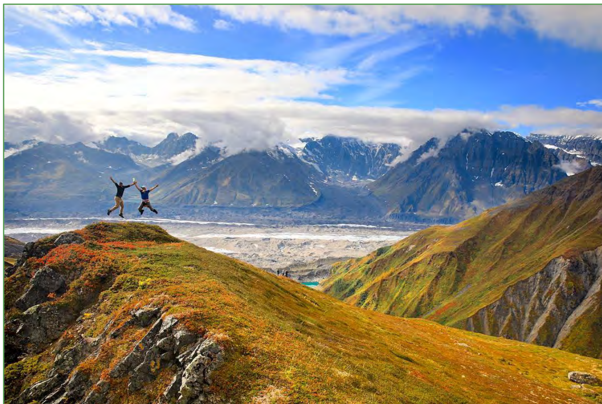
Fall colors and happy guests in Denali National Park

Physical conditioning and consistent exercise prior to these trips is essential. You will be backpacking and hiking off-trail over steep, hilly, and uneven terrain, often covering more than 6 miles in a day with up to 2000' of elevation gain/loss. You may encounter short stretches of thick vegetation and may also experience Alaska's diverse selection of insect species. You will be camping in a very remote wilderness, sleeping in tents, relieving yourself in places with a stunning view, and sometimes enjoying all of the above in the rain. You will be expected to load and unload your own gear, carry a portion of the group gear, and manage your own physical comfort and well-being. Pre-trip physical conditioning should begin no later than 2 months before departure and should include walking or hiking, preferably with loaded backpack of 30-40 lbs.