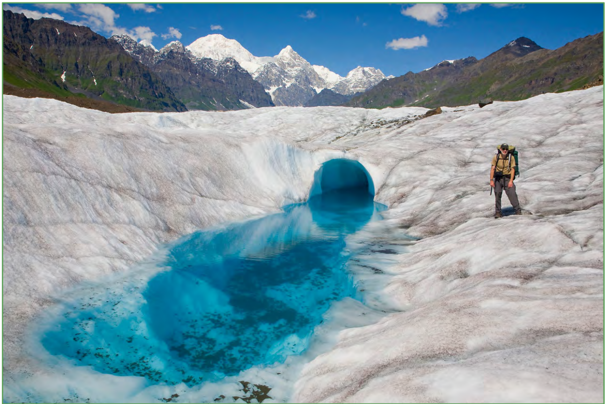
Blue glacier pools and caves are just some of the magic of Denali

GRATUITIES: Tips to guides are left entirely to your discretion. While any amount is greatly appreciated, tips often range from 5-10% of the trip cost per person and are split among the guides.