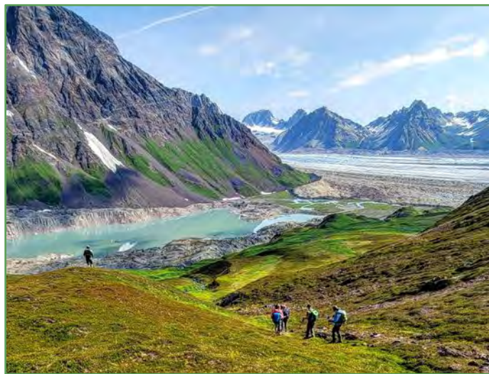
Tundra hiking above Backside Lake with views of the Ruth Glacier

Both TRAVEL GUARD & RIPCORDER are good options. We're excited to share Alaska with you, in the most authentic way we believe possible! Thanks so much for understanding, and for choosing Alaska Alpine Adventures. We'll see you in Alaska soon!