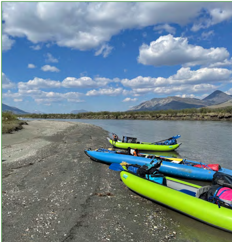
Colorful boats lined up on shore along the Noatak River

Alaska has some of the most dynamic and dramatic weather on the planet. During the summer months in Alaska, average daytime temperatures range from 60° to 80°F. Nighttime and morning temperatures are cooler, but rarely dip below 40°F. Fall arrives early at these latitudes and you'll experience cooler temperatures and fewer hours of daylight in late August and early September. Throughout the summer season, you may experience rain, sun, wind, clouds, and fog on your adventure. We live by the adage "prepare for the worst, hope for the best, and you'll likely end up with some of both".