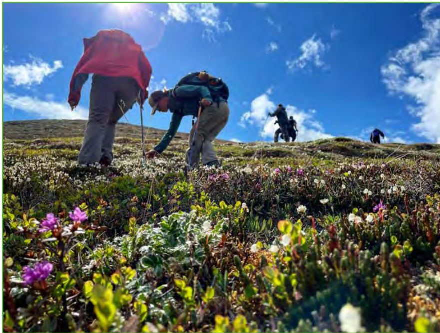
Abundance of colorful arctic wildflowers