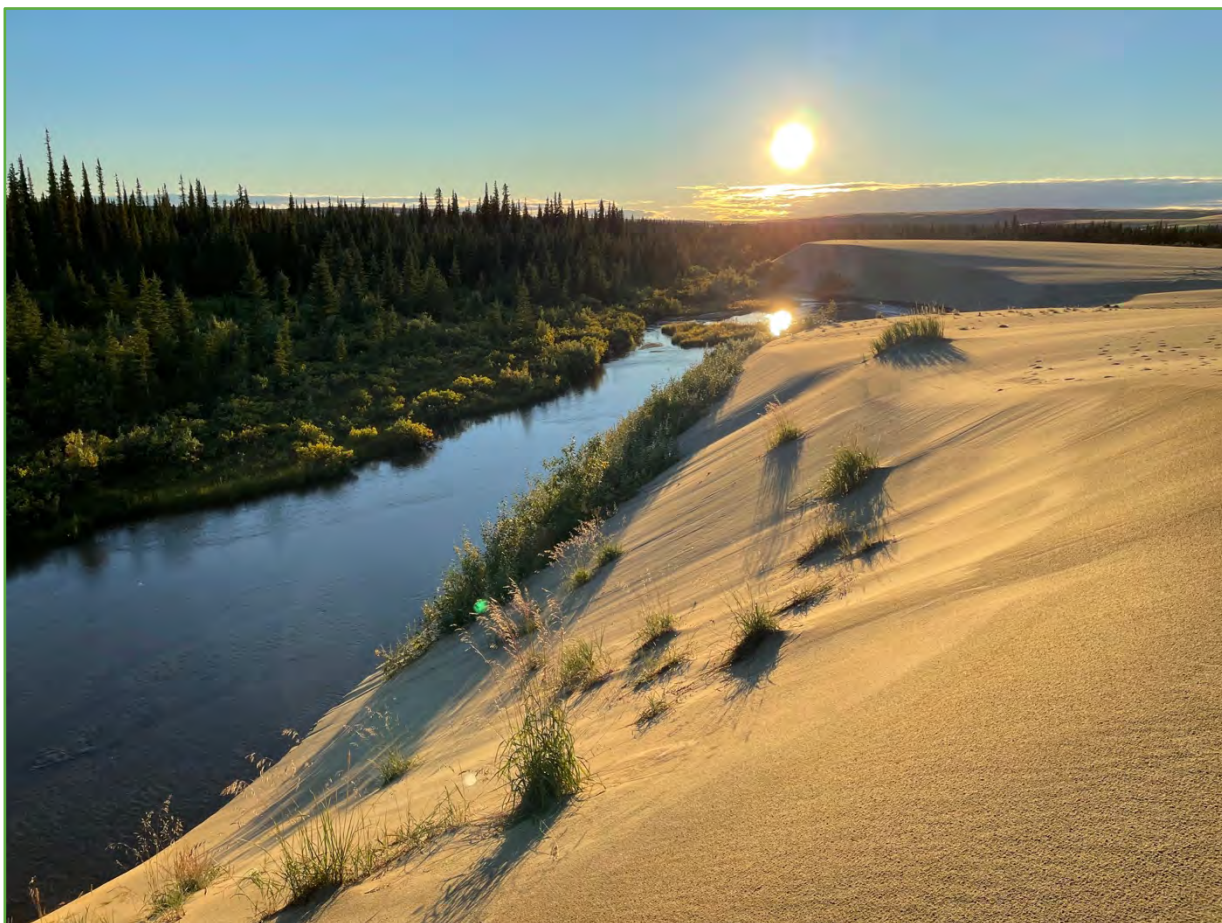
Chasing the setting sun in Kobuk Valley Sand Dunes National Park