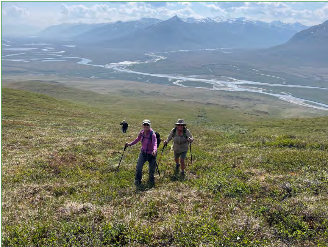
Day hiking from up from the banks of the Noatak River

GRATUITIES: Tips to guides are left entirely to your discretion. While any amount is greatly appreciated, tips often range from 5-10% of the trip cost per person and are split among the guides.