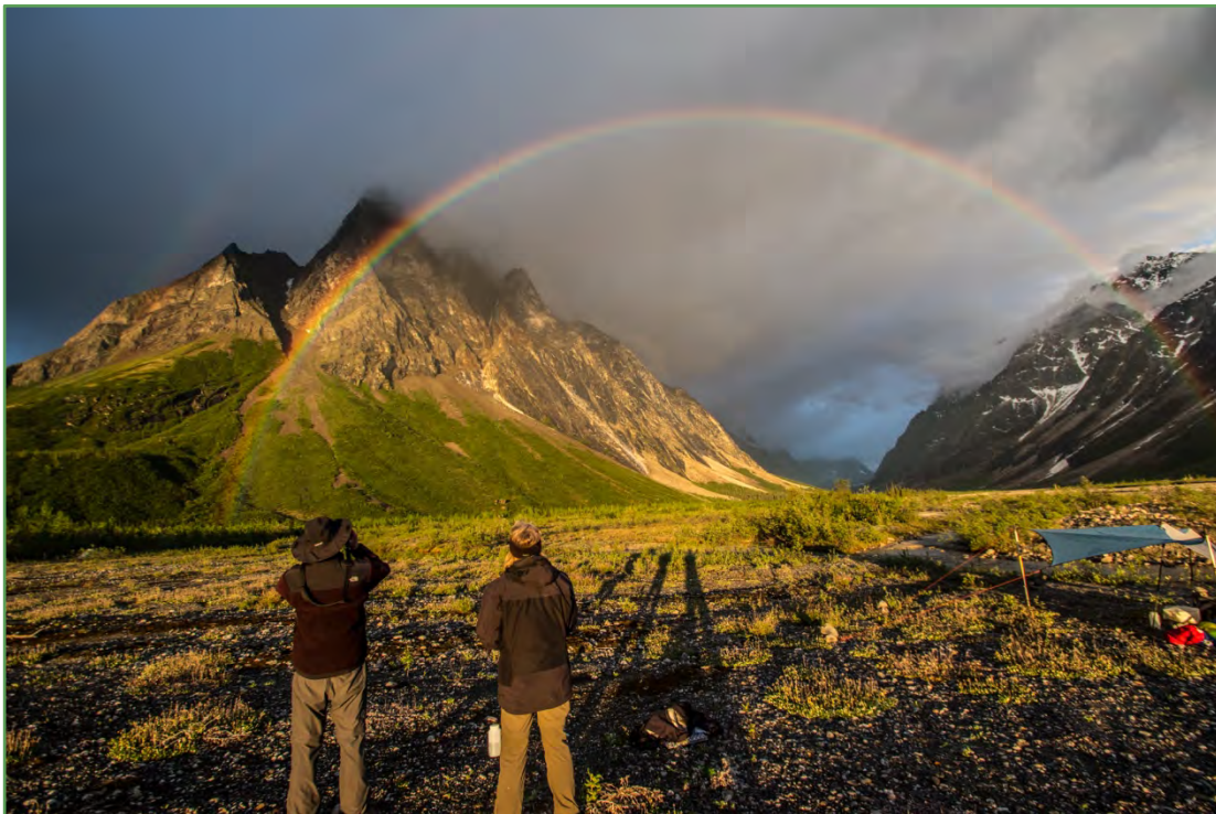
Double rainbows and towering granite peaks over camp

GRATUITIES: Tips to guides are left entirely to your discretion. While any amount is greatly appreciated, tips often range from 5-10% of the trip cost per person and are split among the guides.