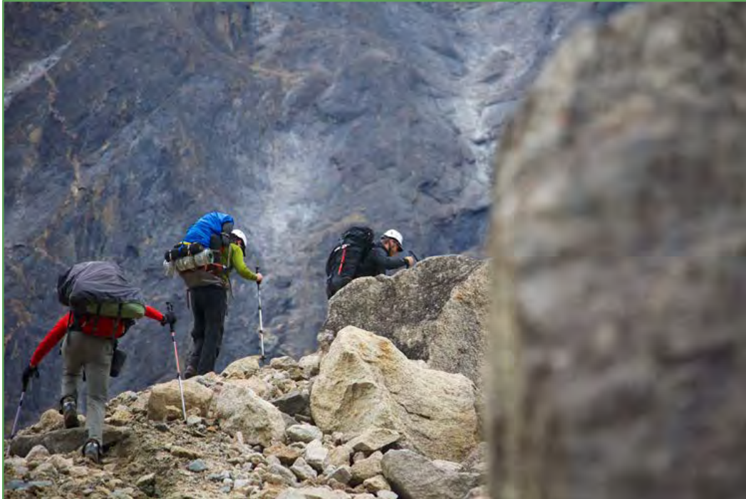
Granite walls tower above talus piles

Alaska has some of the most dynamic and dramatic weather on the planet. During the summer months in Alaska, average daytime temperatures range from 60° to 80°F. Nighttime and morning temperatures are cooler, but rarely dip below 40°F. Fall arrives early at these latitudes and you'll experience cooler temperatures and fewer hours of daylight in late August and early September. Throughout the summer season, you may experience rain, sun, wind, clouds, and fog on your adventure. We live by the adage "prepare for the worst, hope for the best, and you'll likely end up with some of both".