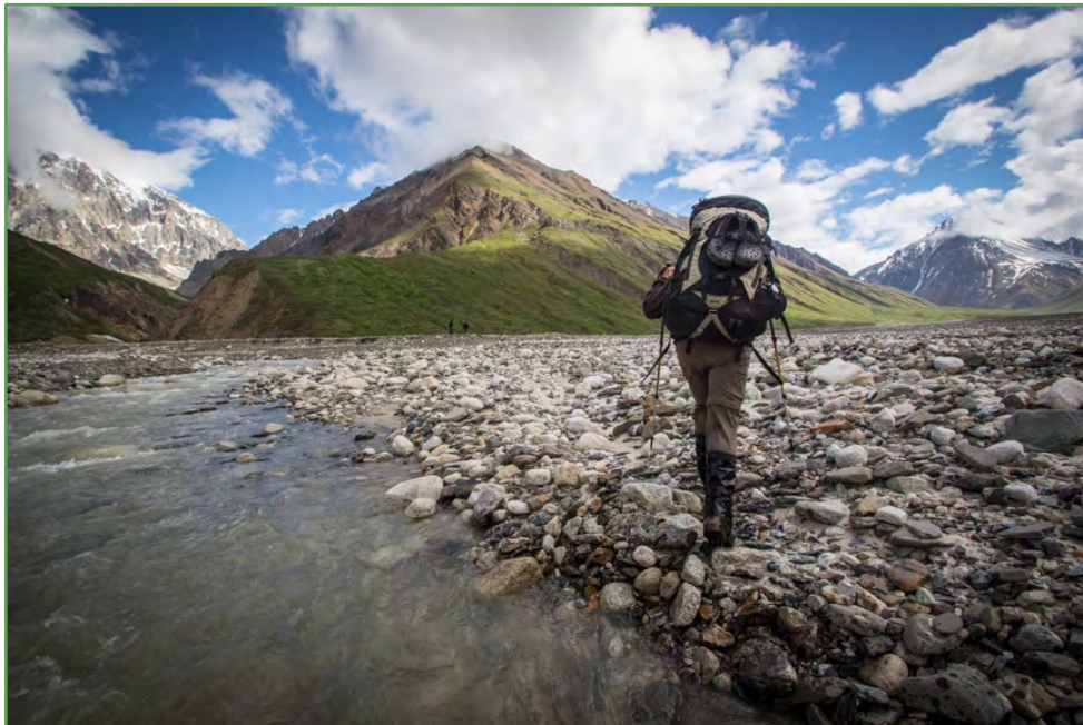
Hiking along the creek with careful footsteps

This level is limited to our "Packaneering" trips, which requires more physical and psychological commitment than our Level 2 or 3 backpacking trips. Physical conditioning and consistent exercise prior to these trips is mandatory. These are expedition-style backpacking trips, and you will be expected to carry a backpack weighing roughly one third or your body weight over glaciated, steep, mountainous, and inconsistent terrain for many consecutive days. This will include many miles of travel over very rocky terrain. You may hike up to 10-miles in a day with up to 3000' of elevation gain/loss. You will also encounter long stretches of thick vegetation, perhaps more than one full day's worth, and may also experience Alaska's diverse selection of insect species. You will be camping in a very remote wilderness, sleeping in tents, relieving yourself in places with a stunning view, and sometimes enjoying all of the above in the rain. You will be expected to load and unload your own gear, carry a portion of the group gear, and manage your own physical comfort and well-being. Previous mountaineering experience may be required, and prior backpacking experience on Level 3 trips (or relevant similar experience) is mandatory. Pre-trip physical conditioning should begin no later than 3 months prior to departure and must include hiking, walking, or climbing (if possible) with at least 45 lbs in your backpack.