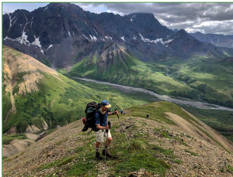
Backpacking the vast landscape in the Revelation Mountains

Both TRAVEL GUARD & RIPCORDER are good options. We're excited to share Alaska with you, in the most authentic way we believe possible! Thanks so much for understanding, and for choosing Alaska Alpine Adventures. We'll see you in Alaska soon!