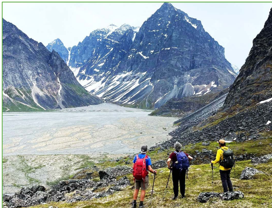
Overlooking the Turquoise Delta toward the receded glacier

For more information on gear, clothing & packing for your trip. click THIS LINK to check out Alaska Alpine Adventure's YouTube channel for helpful and informative packing and gear videos.