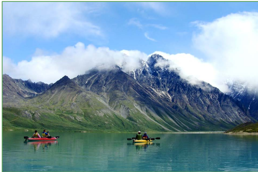
Our double kayaks paddling on Turquoise Lake

Both TRAVEL GUARD & RIPCORD are good options. We're excited to share Alaska with you, in the most authentic way we believe possible! Thanks so much for understanding, and for choosing Alaska Alpine Adventures. We'll see you in Alaska soon!